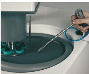
Retractable water hose for easy cleaning

Enviro Filter Unit is a closed loop recirculating filter system which is optionally available. It has a 20 lts. reservoir capacity with 1 micron filter entering the grinder / polisher intake. Enviro can also be coupled with line water and 80 micron filtering system for disposal.