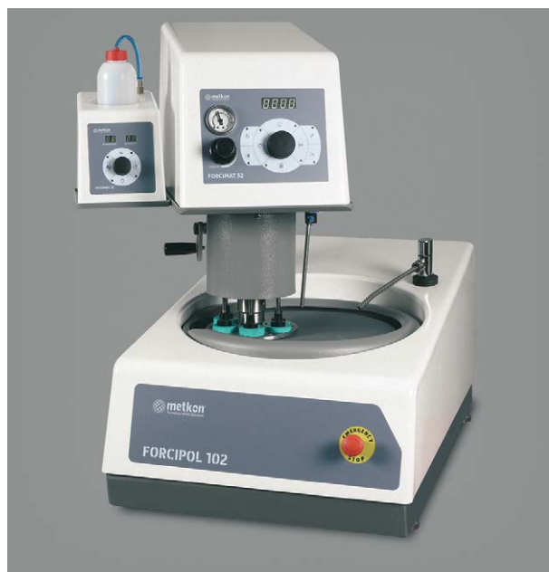
FORCIPOL 102 with Forcimat 52

Automatic Disc Cleaning & Drying function can be activated with a single button to obtain perfectly cleaned disc surfaces in seconds. Smart Water Saving feature allows tons of water saving over the years.