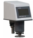
FORCIPOL CONTROL UNIT