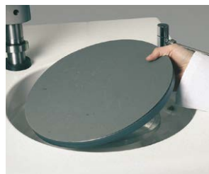
Simple exchange of working discs