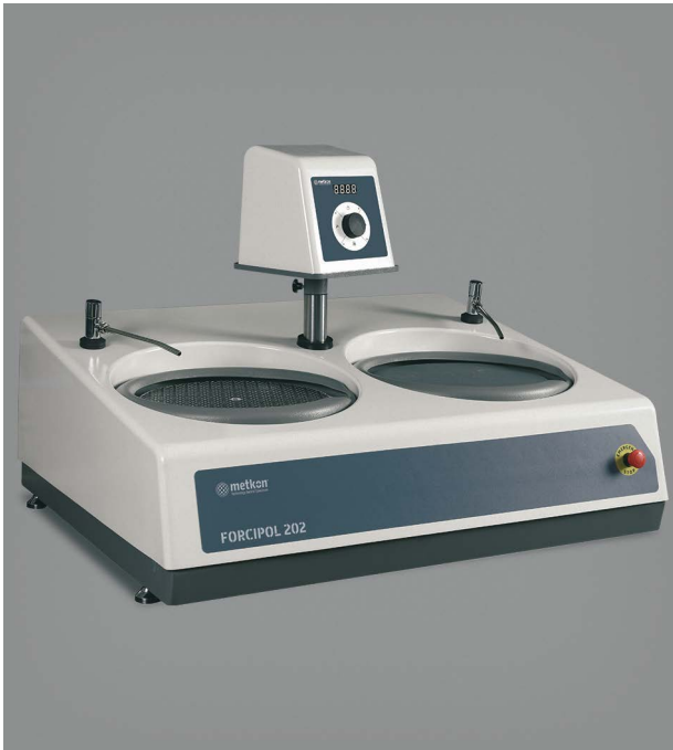
FORCIPOL 202 with Control Unit