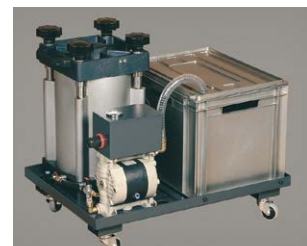
Enviro recirculating filtering unit (1 micron)