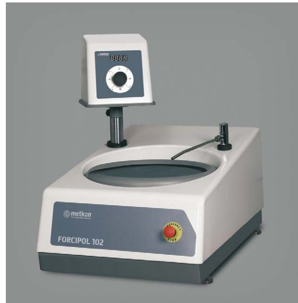
FORCIPOL 102 with Control Unit

The stylish and functional housing is corrosion free and easy to clean. Molded wheel bowls and drains eliminate leaks and the build-up of residue is prevented by constant flushing of the bowl. The drive elements are fixed on heavy duty aluminium alloy casting. The wheels are mounted on ball bearings allowing the application of high pressures to prepare even large specimens. Ball bearings used provide quite and vibration free operation. Water inlet and flexible water outlets with control valves for wet grinding are standard features. FORCIPOL instruments can be used for grinding, lapping and polishing with magnetic backed discs and cloths or by quick and simple exchange of wheels.