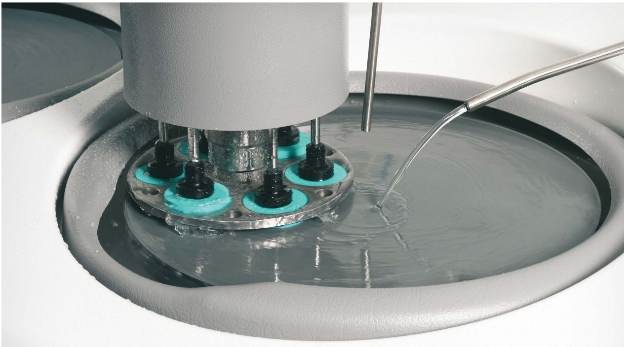
Automatic Water Flow