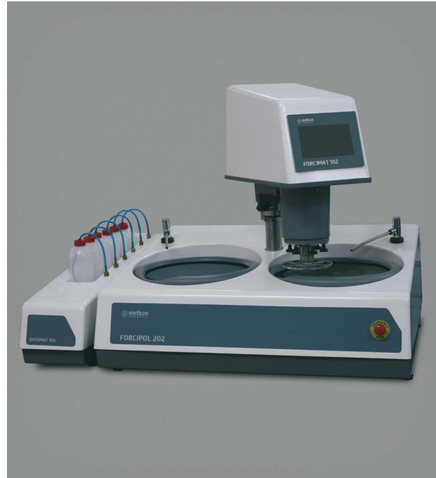
FORCIPOL 202 with FORCIMAT 102 & DOSIMAT 102

The "soft start and stop" feature automatically starts the sequence with a low initial force which is then increased to the preset. Towards the end of the cycle, the force is automatically reduced to 75 % of the setting to prevent scratching. A variety of sample holders for individual or central force applications are available for different sample sizes. Both individual and central force specimen holders can be removed and inserted easily with the help of quick release chuck. By holding the head button on the software, the specimen holder will rotate for easy insertion and removal of the specimens.