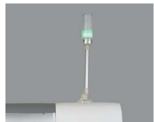
3 Lights Signal Beacon