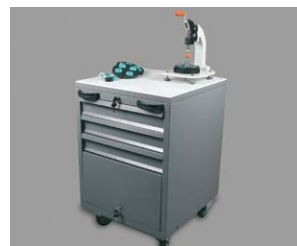
Stand For Levomat