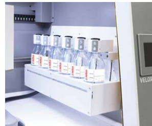
Automatic Fluid Dispenser