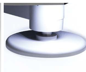
Automatic Sample Cleaning and Drying Unit