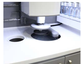
Operator-Free Sample Preparation