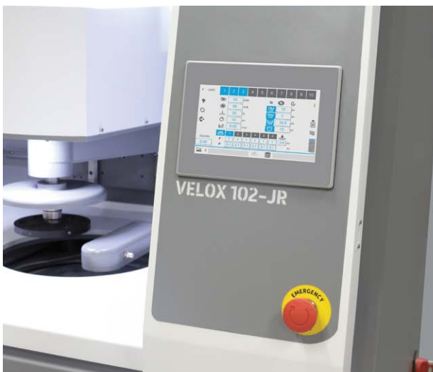
Programmable HMI touch screen controls