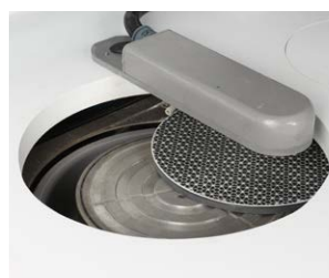
Automatic Disc Replacement Unit